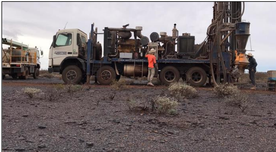
Figure 1. RC drill rig at the LR1 deposit